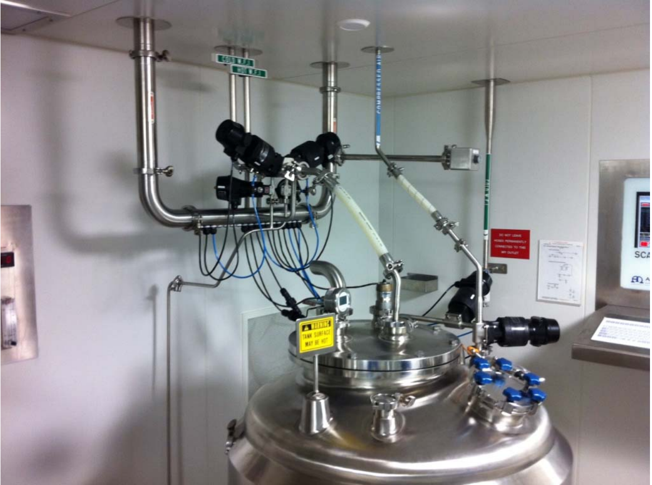
M.E. Engineering provides quality and cost effective services

Key elements of the process and systems include: